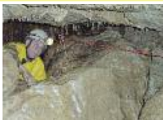
Taped pathway in Dreamtime.

CAVES... form a unique and vulnerable part of our natural and archaeological heritage as well as being a valuable scientific and recreational resource. There are, therefore, many reasons why they are protected and it is important that they are conserved for the benefit of future generations.