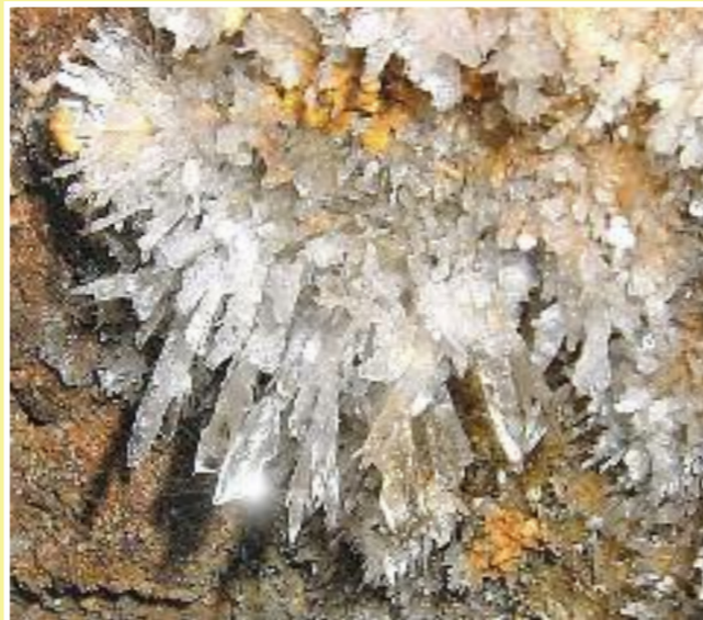
Mineralisation: selenite crystals.

On completion the form is sent via DCA's Conservation Officer to Natural England who are then able to make an overall assessment of the condition of the cave system. The scheme is ongoing and it is hoped to have a steady flow of forms throughout the year so the status of our caves can be assessed continuously. It also provides an opportunity for cavers to feedback any issues that Natural England should be aware of. If you would like further information on the project or would like to get involved please visit our website and download a form http://www.peakcavemonitoring.org.uk