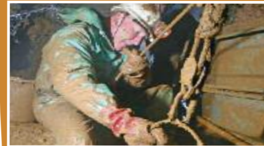
Titan dig: spoil on the way to the surface.

Sidetrack Cave Blue John Cavern Christmas Swallet Dr Jackson's & Perryfoot Caves (P1) Eldon Hole Eldon Quarry Caves Gautries Hole & Car Pot (P3) Giants Hole / Oxlow Caves and Maskhill Mine Long Cliff Mine Nettle Pot Odin Cave Odin Mine Old Tor Mine P5 Swallet P7 Swallet P8 (Jackpot) Peak & Speedwell Caverns Rowter Hole Russet Well Sheepwash Swallet Suicide Cave Treak Cliffe Cavern Windy Knoll Cave Winnats Head Cave