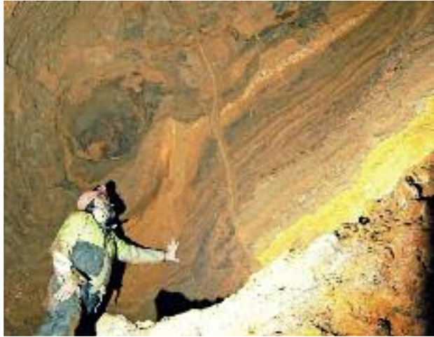
Sediment sequence: Masson Cavern.

Natural England ...supports the scientific exploration of caves and work to discover new caves. Without this work we would have no information on the extent of caves nor understand as much as we do about how cave systems have developed. Knowledge from cavers undertaking trips down known cave systems is also invaluable in keeping us informed of the condition of cave systems and alerting us to problems. (See useful contacts and links)