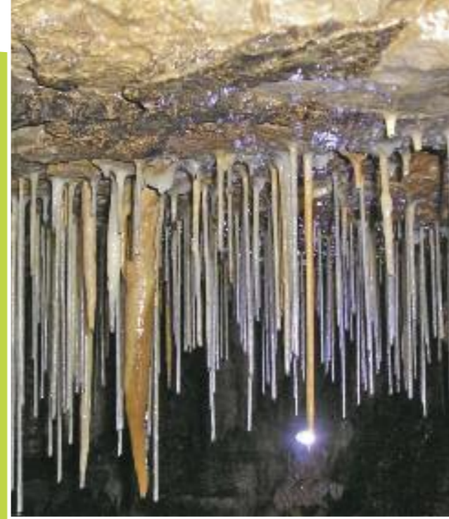
Speleothems: Dreamtime roof decoration.