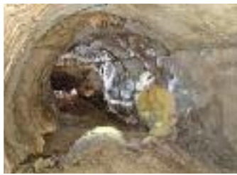
Cave Passage Morphology: Water Icicle Close Cavern.